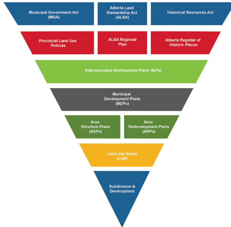
Figure 2.1. Alberta's Land Use Planning Framework

All together, these plans and policies provide a consistent structure and framework to guide land use and development in the Town.